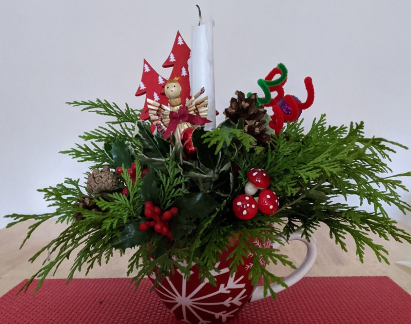
Cup of Christmas